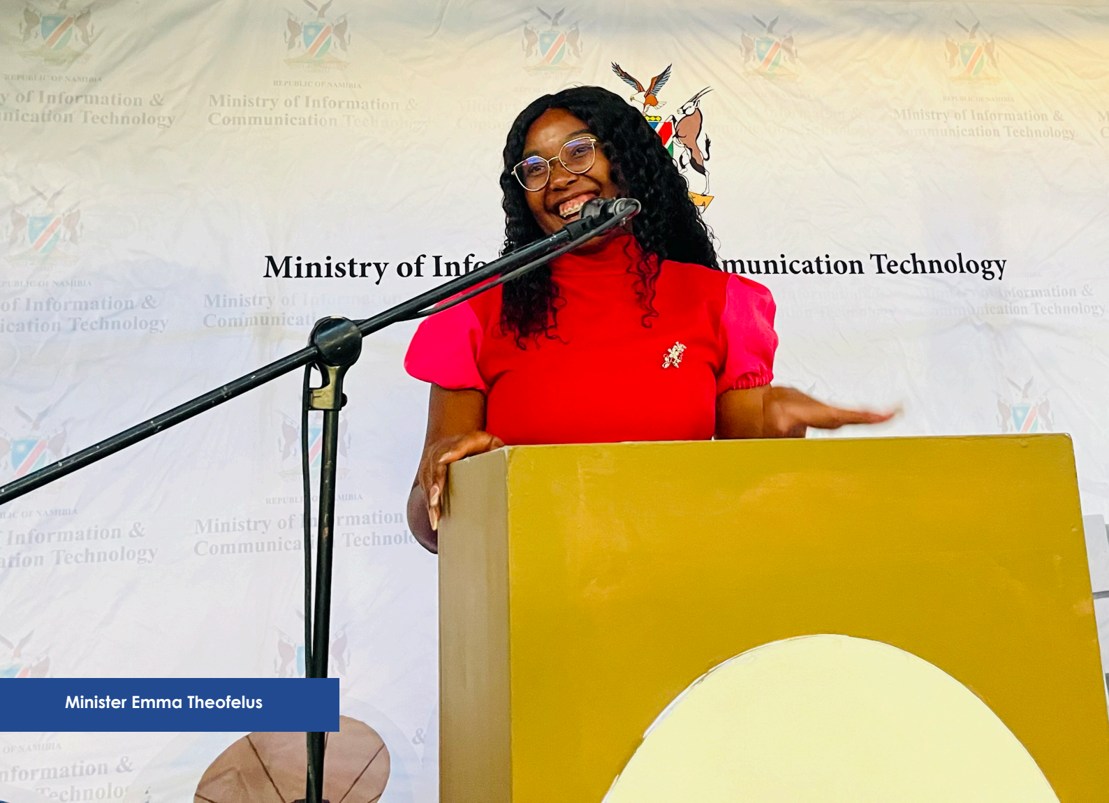
Minister Emma Theofelus