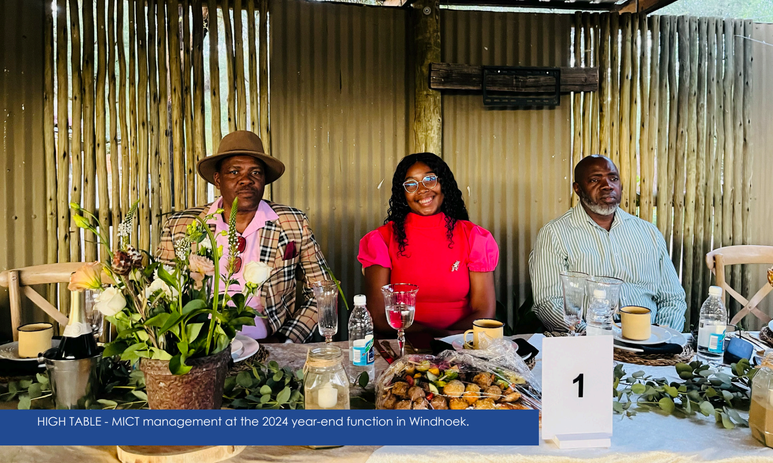
HIGH TABLE - MICT management at the 2024 year-end function in Windhoek.