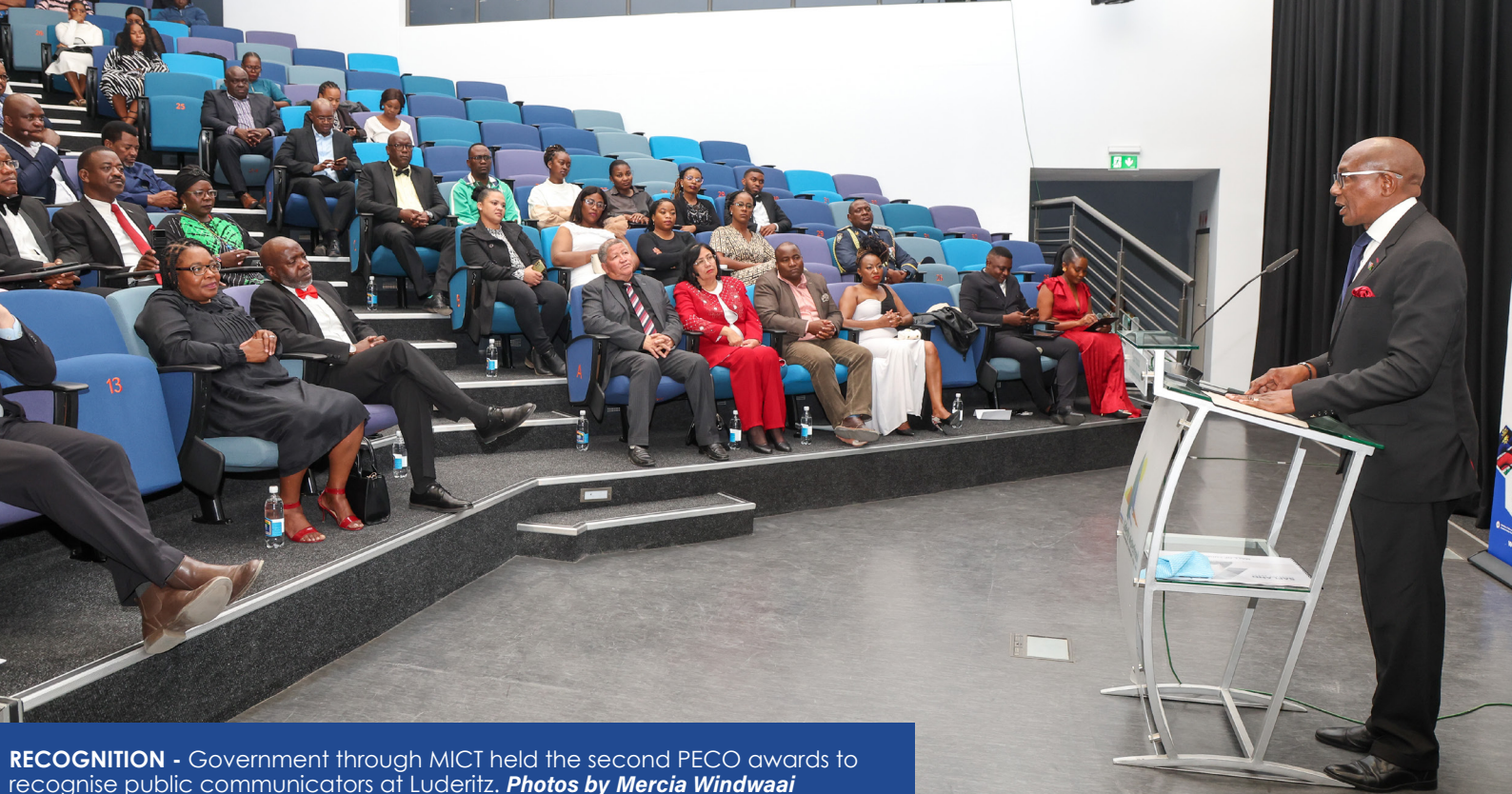
RECOGNITION - Government through MICT held the second PECO awards to recognise public communicators at Lüderitz.